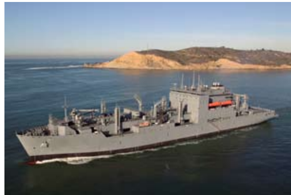
T-Ake ships for the US Navy

Detectors are combination heat/smoke detectors, normal heat detectors 57 and 80 degree c as well as special