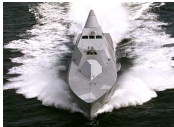
The visby Corvette for the Swedish navy