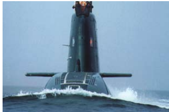
Submarine Class 214 for the Hellenic Navy